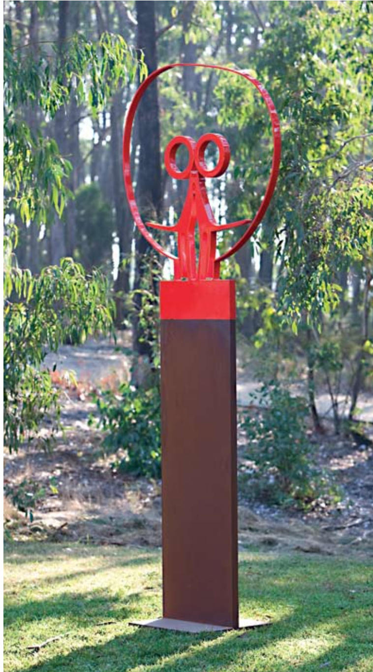
7 Kiss and fly 2008 painted mild steel, corten steel 264 x 103 x 47cm edition of 3