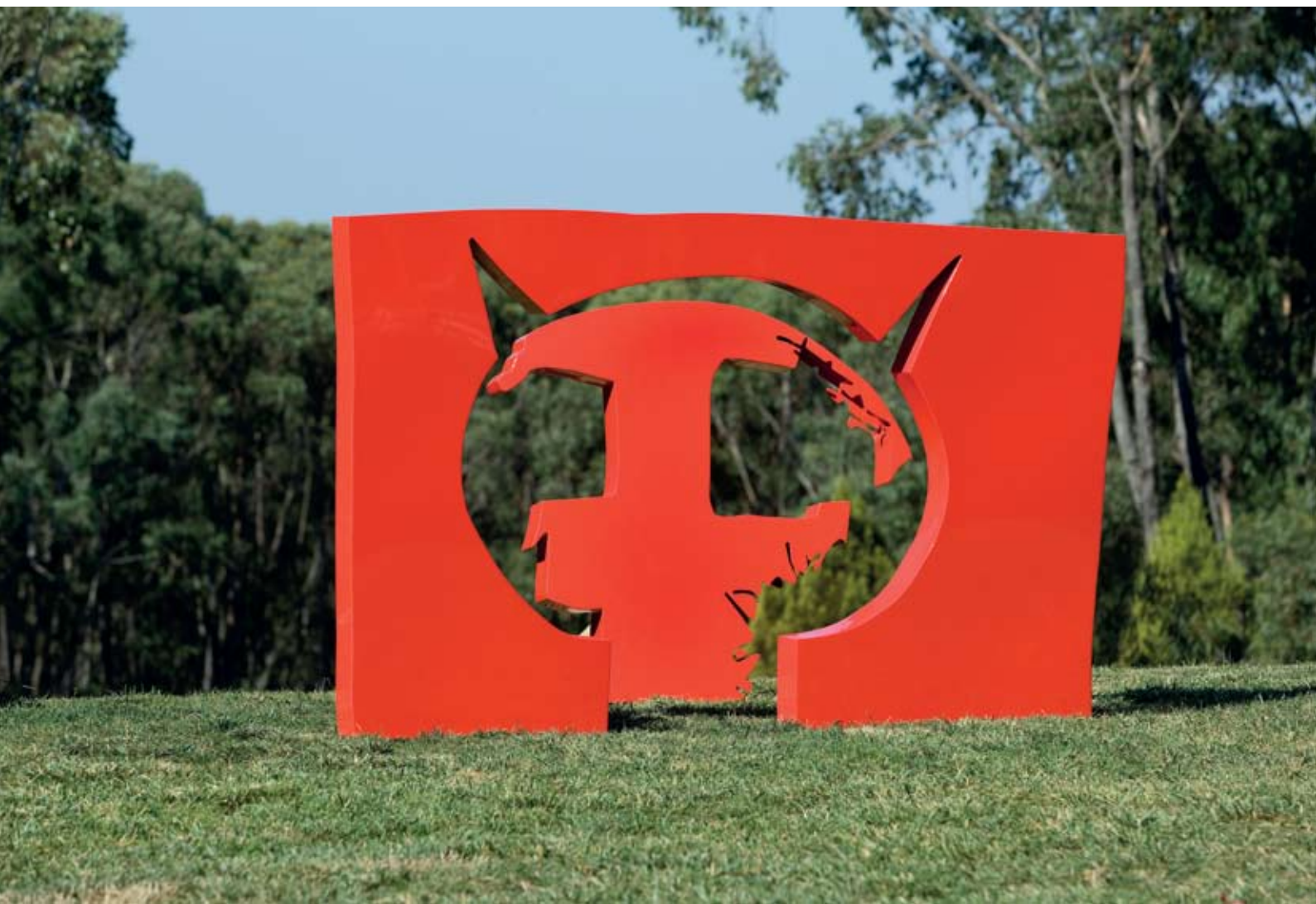
8 Self portrait as a parasite 2008 painted steel 112 x 184 x 21cm edition of 3