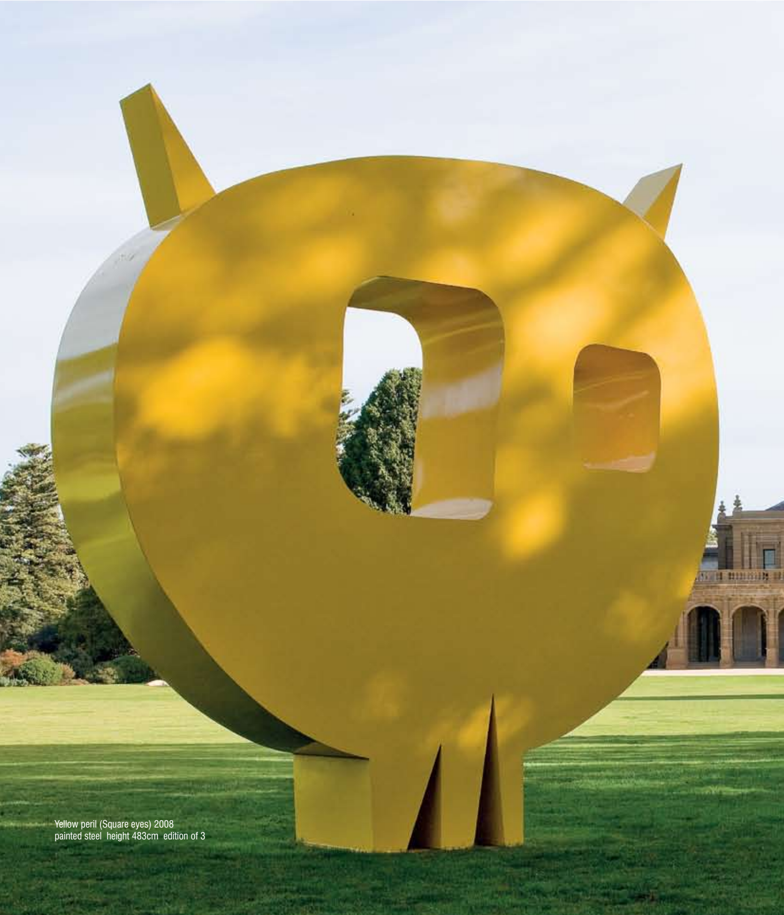
Yellow peril (Square eyes) 2008 painted steel height 483cm edition of 3