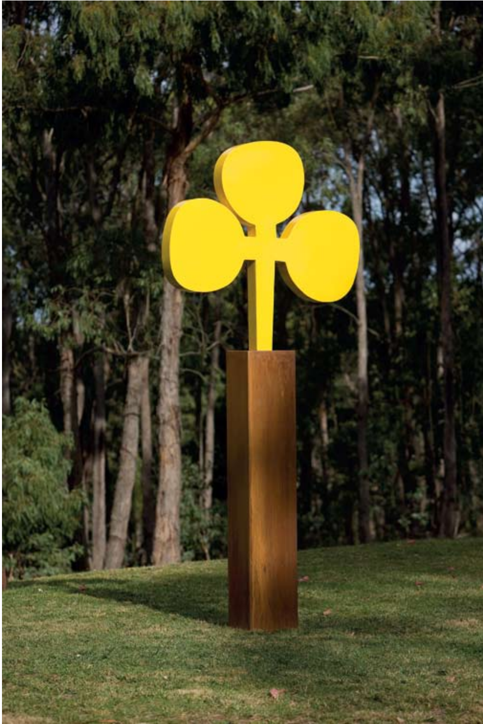
1 Clover 2007 painted mild steel, corten steel 282 x 123 x 55cm edition of 3